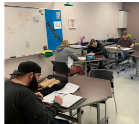
The Murphy Centre: Academic Readiness Program