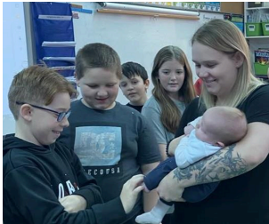
Roots of Empathy: Building Empathy and Supporting Positive Wellbeing

Providing youth with access to early literacy and development programs, recreational activities, mentors and other opportunities to discover and develop their talents and interests as they progress through school and into adulthood.