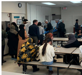
Association for New Canadians: Fresh Start Breakfast Program

Improving access and availability of social and health-related support services needed to revitalize and strengthen neighborhoods and overall community engagement.